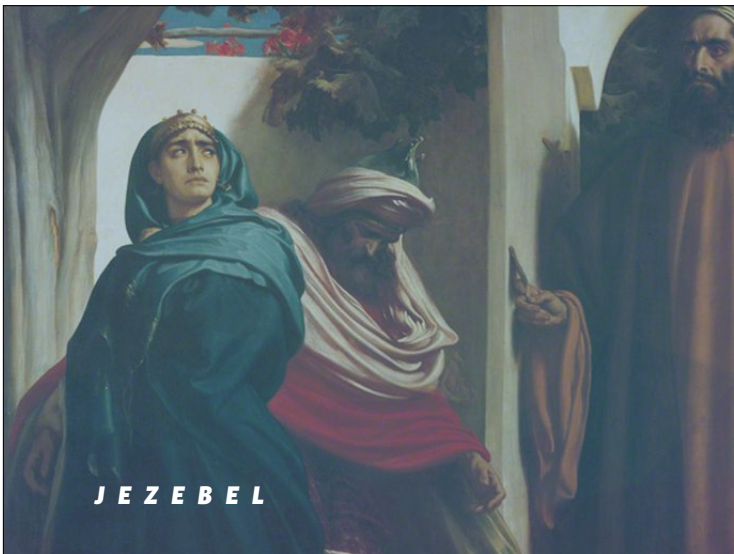
J E Z E B E L

as a leader, spouse, parent, boss, mentor or friend—you approve of, if not partake in, that sin.